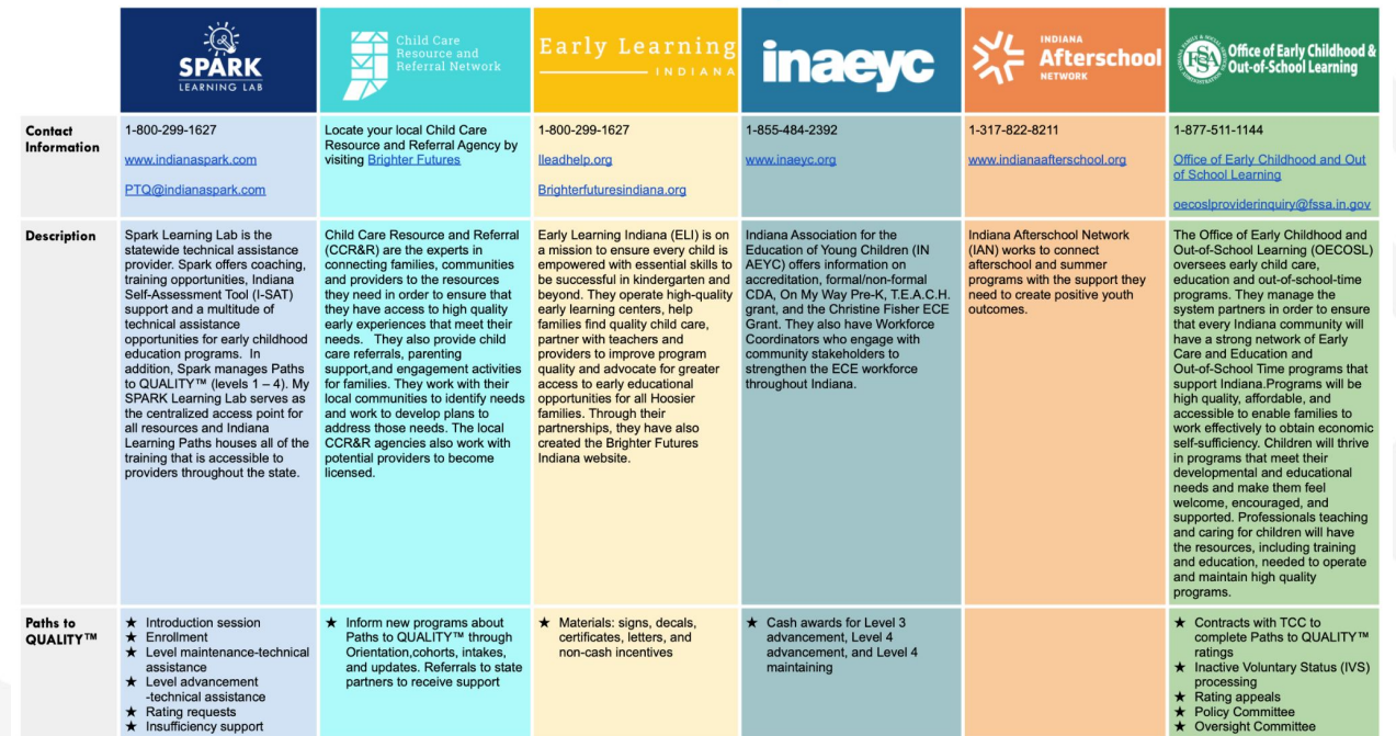
Indiana Early Care & Learning System Partner Map

→ Find Partner Map: My SPARK Learning Lab