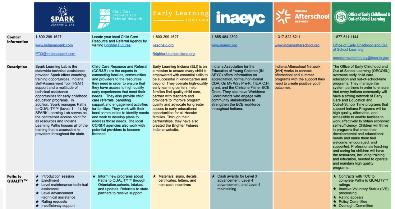
Indiana Early Care & Learning System Partner Map

→ Find Partner Map: My SPARK Learning Lab